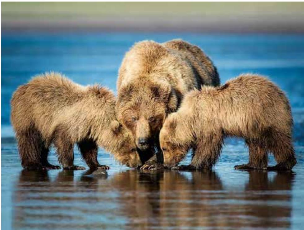
“Clam Digging Lesson”