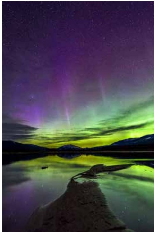
“Aurora on the Water”