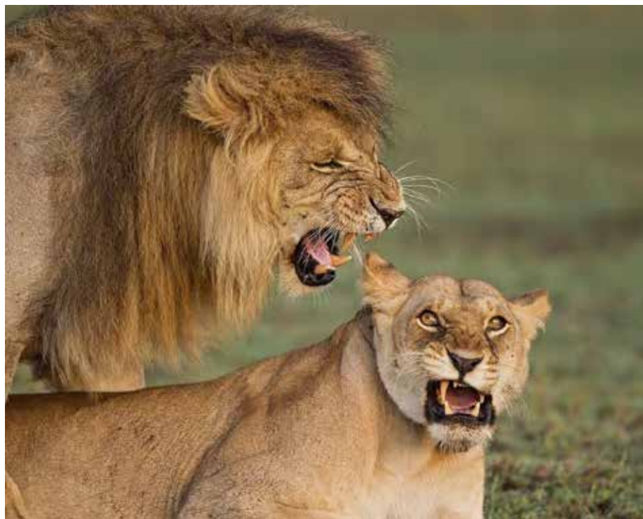
“Lions on their Honeymoon”