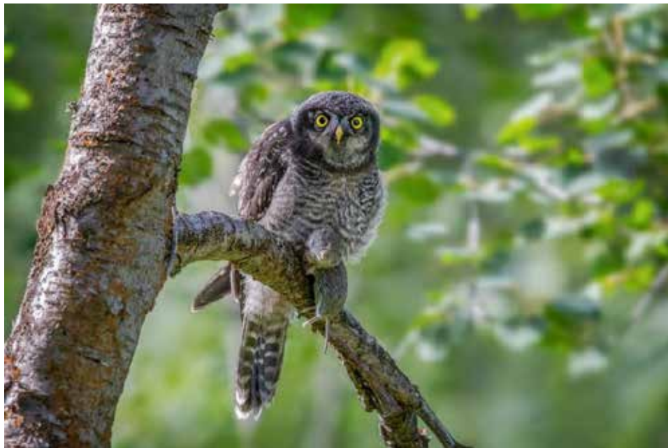
“Hawk Owl Catch” 25.5 Points Norm Dougan Kamloops Photo Arts Club