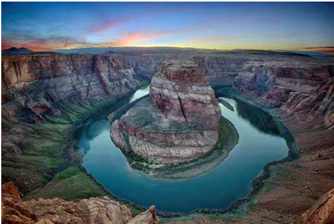
“Horseshoe Bend at Sunset”